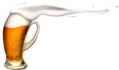
Schmohz Root Beer

Schmohz, home of Hopknocker, Bonecrusher, Amber Tease, and Treasure Chest, proudly presents to the increasing number of runners, beer drinking runners that is, our racing brew Achilles Ale, providing a lighter easy drinking ale. Refreshing and exhilarating during and after the race, Enjoy an Achilles!